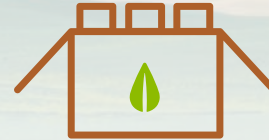
Prepared & Packaged